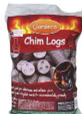
Wyre Forest Charcoal