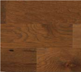
color 875 burnt amber