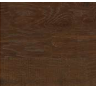
color 936 barnwood