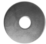
(12) 1/4" washers