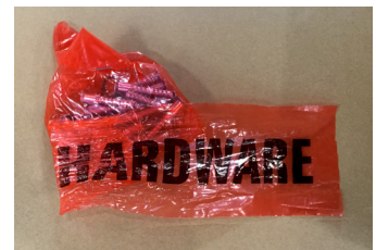
Example of red bag

Your hardware can be found taped under the furniture frame in a red bag or a small box with a red string.